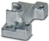
Panel mounting flange for HEAVYCON-ADVANCE TMS housing with screw locking