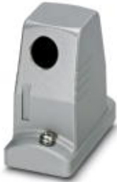
HEAVYCON ADVANCE EMV sleeve housing B10, with screw locking, height 100 mm, with 1xM25 thread, lateral cable outlet

Please be informed that the data shown in this PDF Document is generated from our Online Catalog. Please find the complete data in the user's documentation. Our General Terms of Use for Downloads are valid ( http://download.phoenixcontact.com )