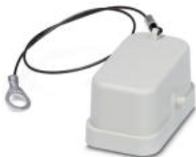
Protective cover for HC-COM-K... housing for male contact inserts

Please be informed that the data shown in this PDF Document is generated from our Online Catalog. Please find the complete data in the user's documentation. Our General Terms of Use for Downloads are valid ( http://download.phoenixcontact.com )