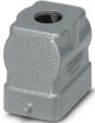
HEAVYCON B6 sleeve housing, for single locking latch, height: 56 mm, with 1 x M25 thread, straight cable outlet

Please be informed that the data shown in this PDF Document is generated from our Online Catalog. Please find the complete data in the user's documentation. Our General Terms of Use for Downloads are valid ( http://phoenixcontact.com/download )