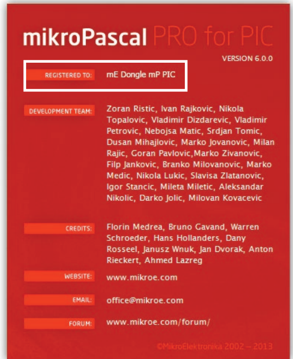
Figure 1-2: mikroPascal PRO for PIC® About Window