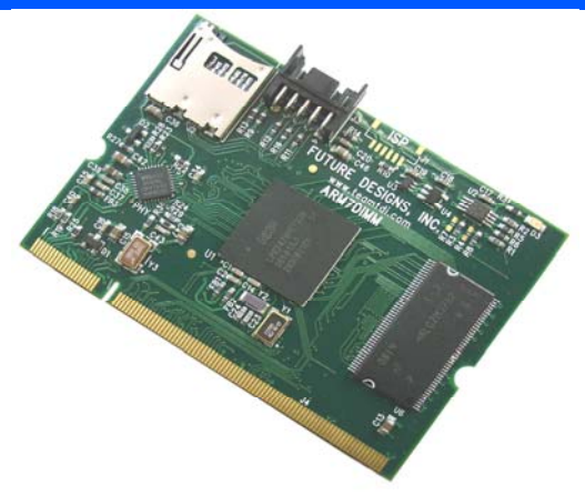
Actual PCB dimensions are 2.66" x 1.89"