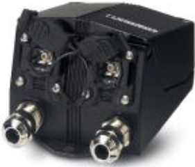
Terminal outlet SC-RJ IP65/67, 2 slots version 6, with protective plugs, 2 cable entries

Please be informed that the data shown in this PDF Document is generated from our Online Catalog. Please find the complete data in the user's documentation. Our General Terms of Use for Downloads are valid ( http://phoenixcontact.com/download )