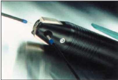
PC 24 - 14 H CLOSE UP VIEW

HAND-CRIMPER TRAPEZOID CRIMPING SIDE AND FRONT INSERTION UNIVERSAL - DIE RANGE 24-14 AWG (0.25-2.50 MM 2 ) LENGTH: 7.9 INCHES (200 MM) WEIGHT: 35.2 OUNCES (1000 G) PRESSURE: 58 PSI (4 BAR)