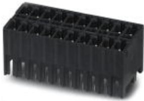
The figure shows a 10-pos. version with 20 contacts

Please be informed that the data shown in this PDF Document is generated from our Online Catalog. Please find the complete data in the user's documentation. Our General Terms of Use for Downloads are valid ( http://phoenixcontact.com/download )